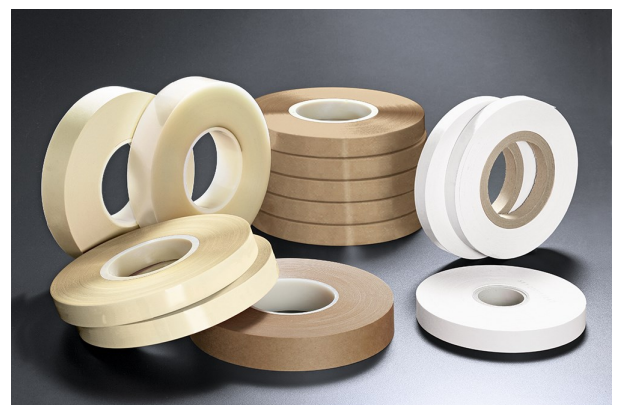
Assorted tapes available online